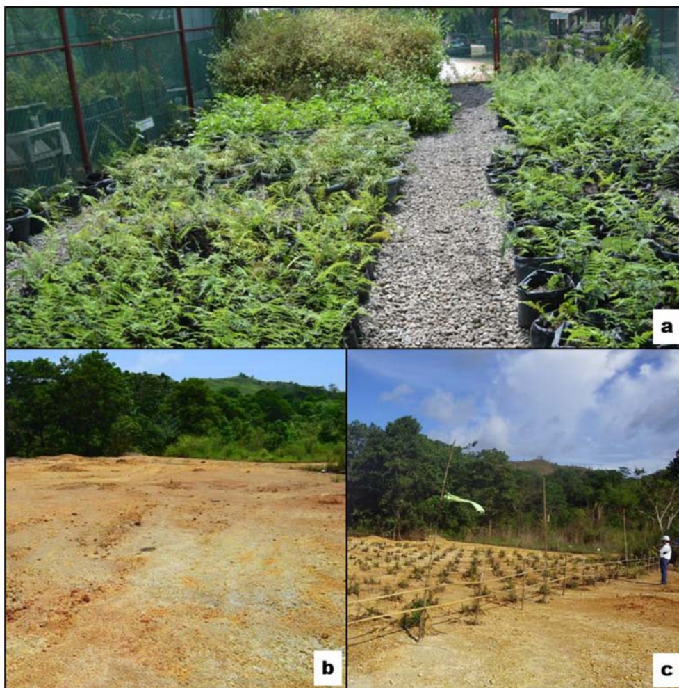
Fig. 2. Photographs of post-mining rehabilitation activities. a) nursery at Xavier University where most of the ferns were propagated, b) the experimental rehabilitation site at Suyoc North (Surigao) which was completely barren of vegetation, c) rehabilitation experiment using P. calomelanos at Suyoc North.

metals of high purity are deposited on the cathode [35]. This method is also used by mining companies for extracting valuable minerals from Cu–Au ores. The use of electrowinning in bioremediation studies was initially performed by [36] in the removal of various metals from acid mine drainage. In the electrowinning experiments with the use of the nitric acid digestion method, the recovery of Cu from a solution during electrowinning was relatively high, ranging from 72 to 99%, with most of the samples having Cu recovery of > 90% (Table 2a). The Cu recovery using the aqua regia digestion method ranged from 42 to 96% with most of the samples having a recovery of > 80% (Table 2b). It appears that the nitric acid digestion method was more effective than aqua regia in recovering Cu from P. melanocaulon . Notable decreases in the Cu content of both solutions were observed. The recovery of Cu